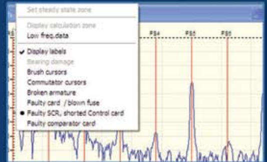
Calculates and identifies mechanical as well as electrical faults.